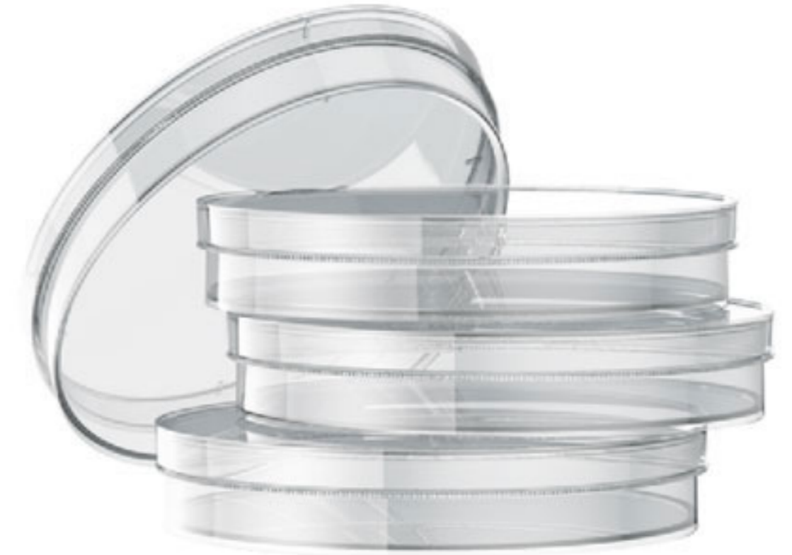
individual soft blister packed