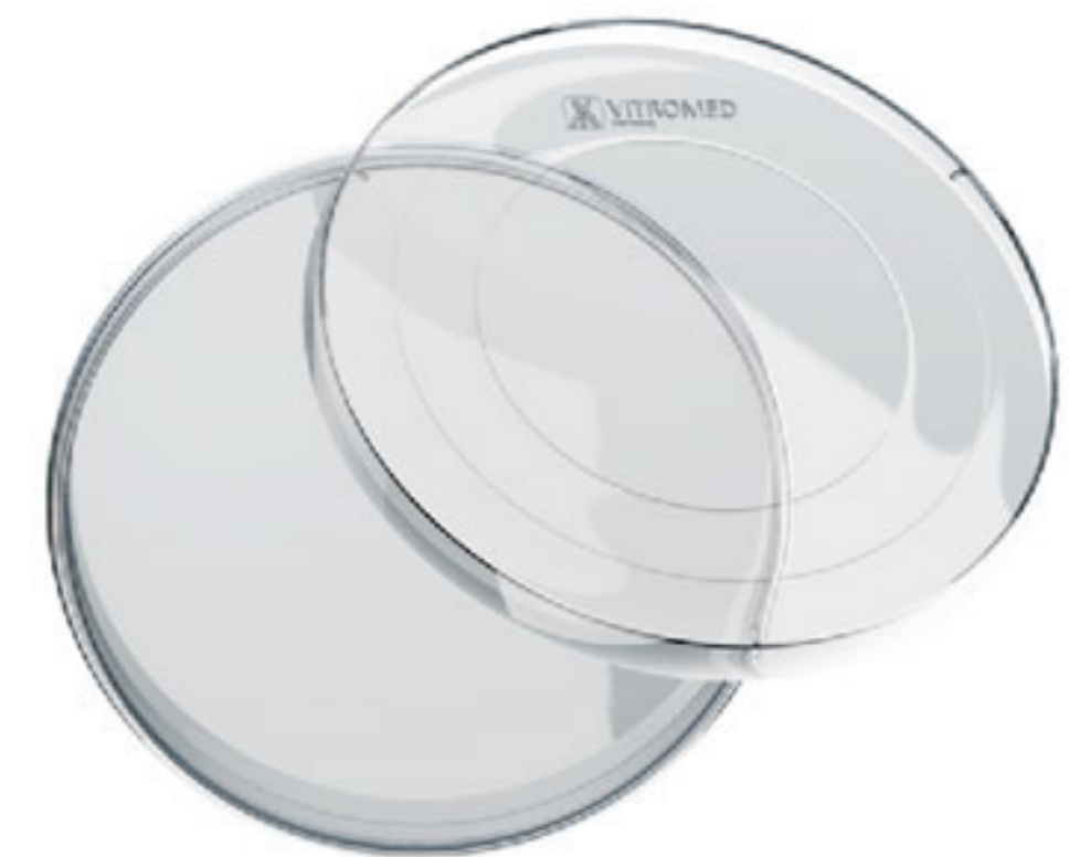
individual soft blister packed