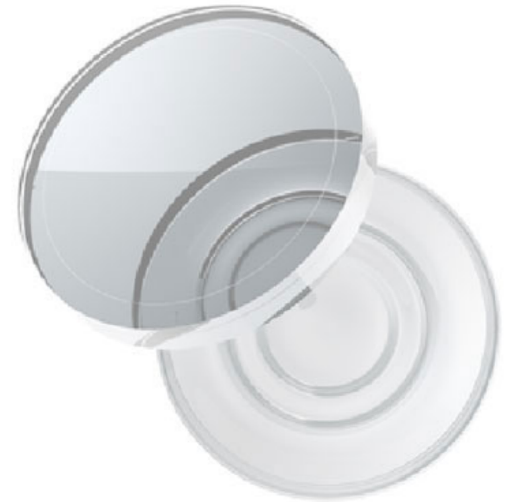
individual soft blister packed