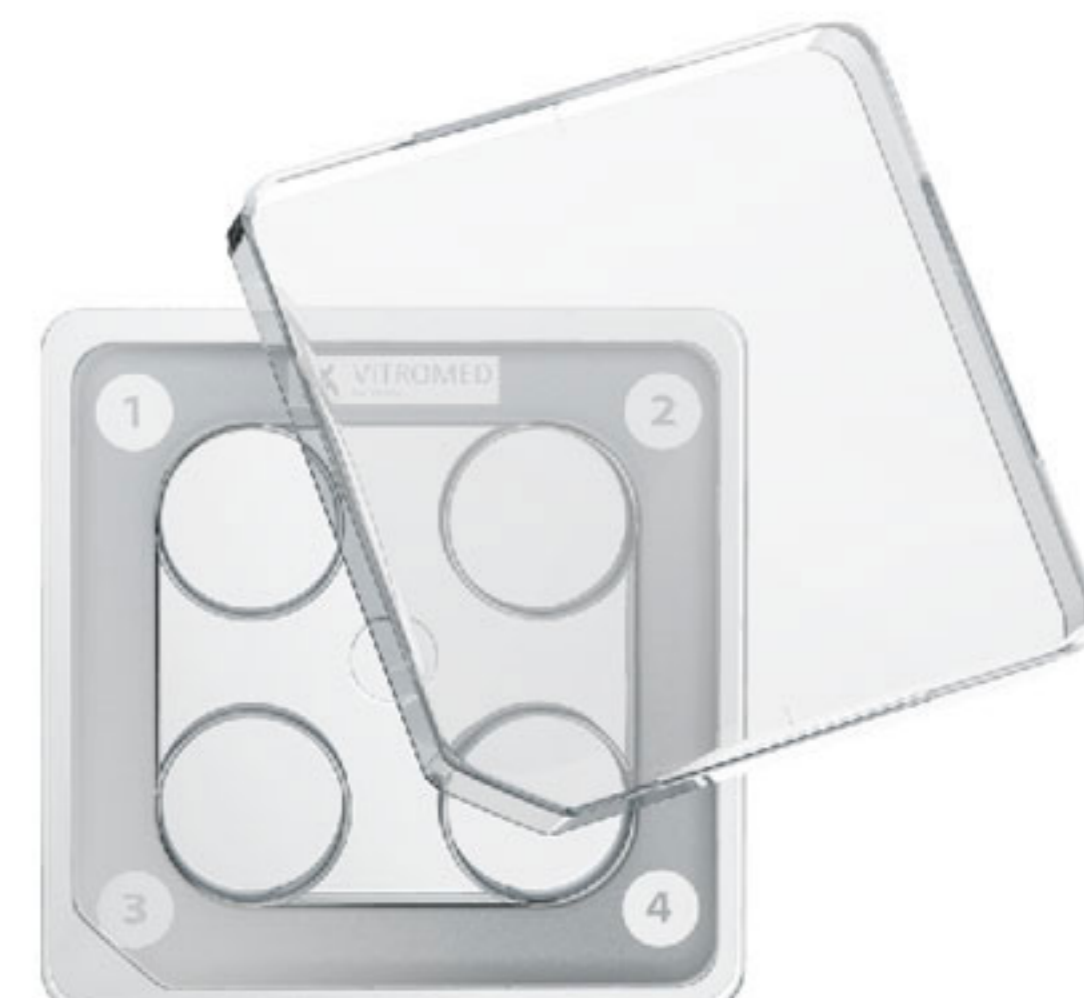
individual soft blister packed